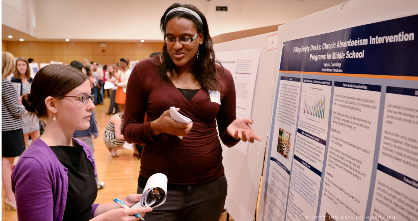
A Carolina student presents her research at the annual Celebration of Undergraduate Research.